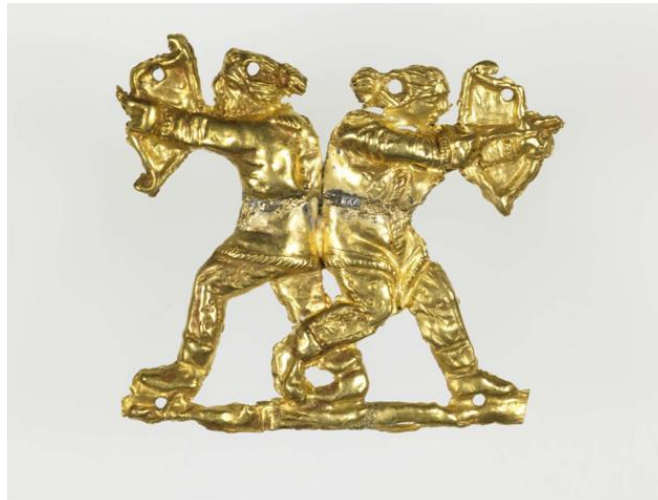
Figure 4: Gold Clothing Appliqué Depicting Two Archers.

Horse burials described by Herodotus were also confirmed by the archaeological investigation (Graph 5). Soldiers with spears and horses' corpses could be found around the main chamber of the burials [8].