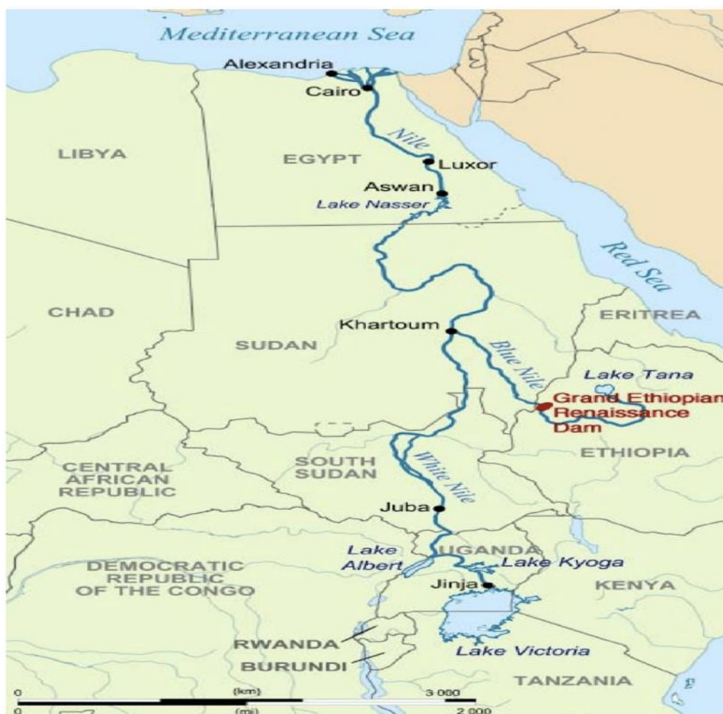
Figure 2: Map of the Nile River.

Furthermore, Herodotus conducted a truly astonishing number of investigations into these rivers and streams. He measured the fish abundance and taste of the water and the dimensions and connections among the tributaries. On the one hand, the documents Herodotus provided during his far-flung voyages were accurate and convincing. While recording the distance covered from the inland place Gerrhus to the sea, he pointed out that it was a forty-day trip by sea. Taking into account the length of the shallow streams, Herodotus would use measurements such as “a five day’s navigation” and “distance of four days” [4].