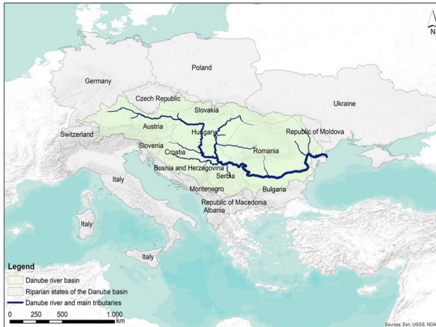
Figure 3: Map of the Danube River.